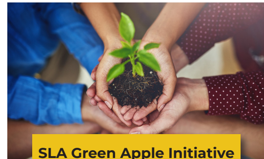
SLA Green Apple Initiative

As a family-owned company, we treat our team members, students, and school communities as an extension of our own SLA family. Our team loves what they do and are eager to greet your students daily and support them throughout their educational experience. We promise to watch over your family and feed them as if they were our own.